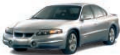
Shown: Bonneville SSEi in Galaxy Silver Metallic with some optional equipment.