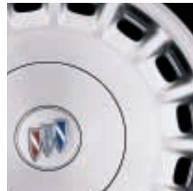
15" Aluminum; available on Custom and Limited packages.