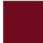
Cardinal Red Metallic