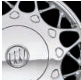
15" Chrome-Plated cover; available on Custom Package, standard on Limited Package.