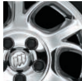
16" Special Edition Chrome-Plated; standard on Special Edition Package.