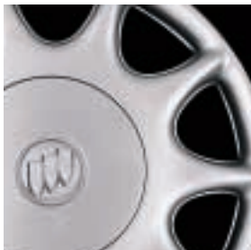
15" Deluxe cover; standard on Century and Custom Package.