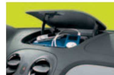
AUXILIARY GLOVE BOX A center-dash auxiliary glove box offers storage for sunglasses, cell phones, or MP3 players.