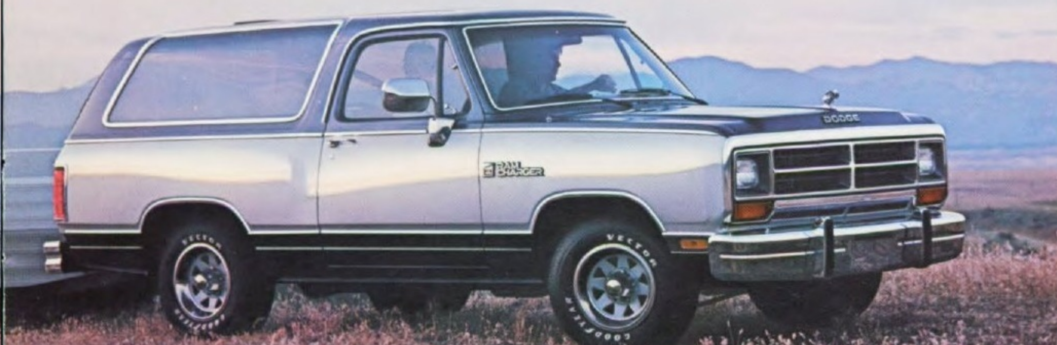
Dodge Ramcharger Two LE, shown in Charcoal Pearl Coat/Radiant Silver.