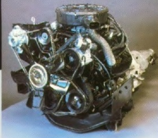
5.2-liter V-8 engine with electronic fuel injection.

Only Ramcharger offers you a choice of two-wheel or four-wheel drive in a full-size sport utility. Dodge Ramcharger satisfies your taste for adventure and still provides family-room space and comfort. Perfect for work or play with all the high tech features you've come to expect from Dodge such as electronic fuel injection, stainless steel exhaust system, and an advanced phosphate treatment and primer for a mirror-like Clear