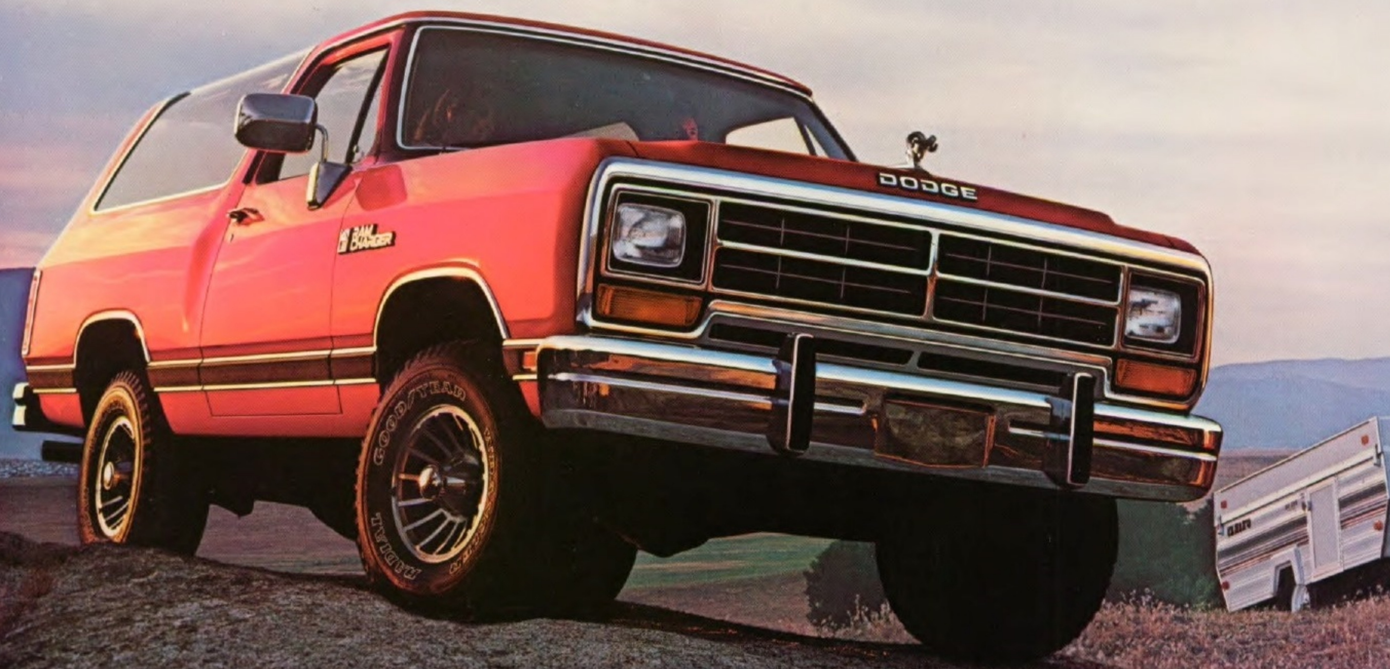
Dodge Ramcharger 4x4, shown above in Graphic Red. Shown on cover, Ramcharger Two LE in Charcoal Pearl Coat/Radiant Silver.

Some of the equipment shown or described throughout this catalog is available at extra cost.