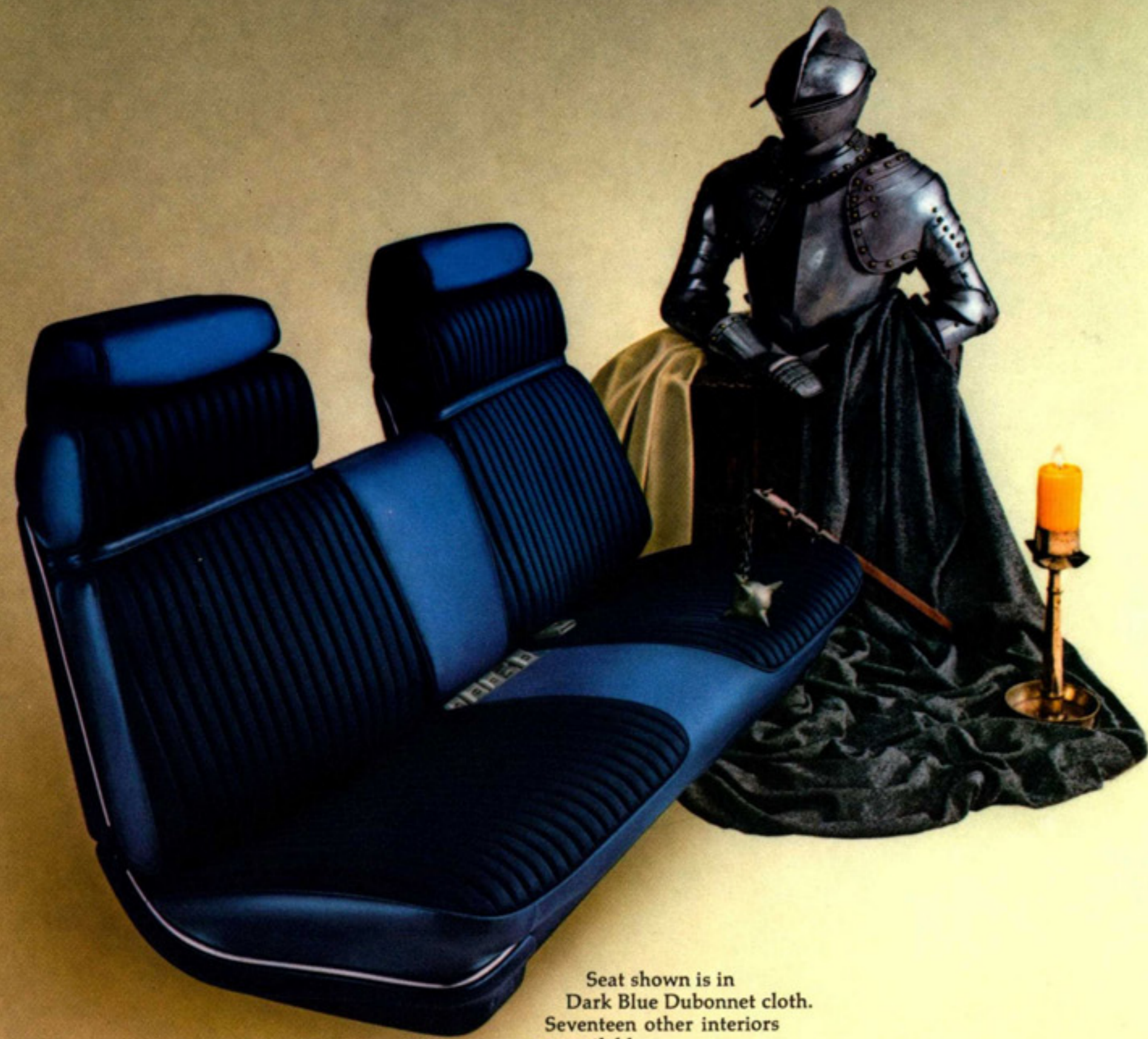
Seat shown is in Dark Blue Dubonnet cloth. Seventeen other interiors are available.

Rarely does an automobile become a classic in its own time. The Fleetwood Eldorado has been accorded this status both by automotive critics and by the affection and respect of the motoring public. This new edition of the Eldorado has been refined in styling, yet it retains the dramatic lines that have made it the most wanted luxury car in history. The quiet, softer riding Fleetwood Eldorado is the only car in the world to combine, as standard equipment, the precision of front-wheel drive, the manoeuvrability of variable-ratio power steering, the balance of automatic level control and the fidelity of front disc brakes. Its lavish new interiors are the finest in any luxury personal car. By any measure, the front-wheel drive Fleetwood Eldorado has earned its recognition as the world's finest personal car.