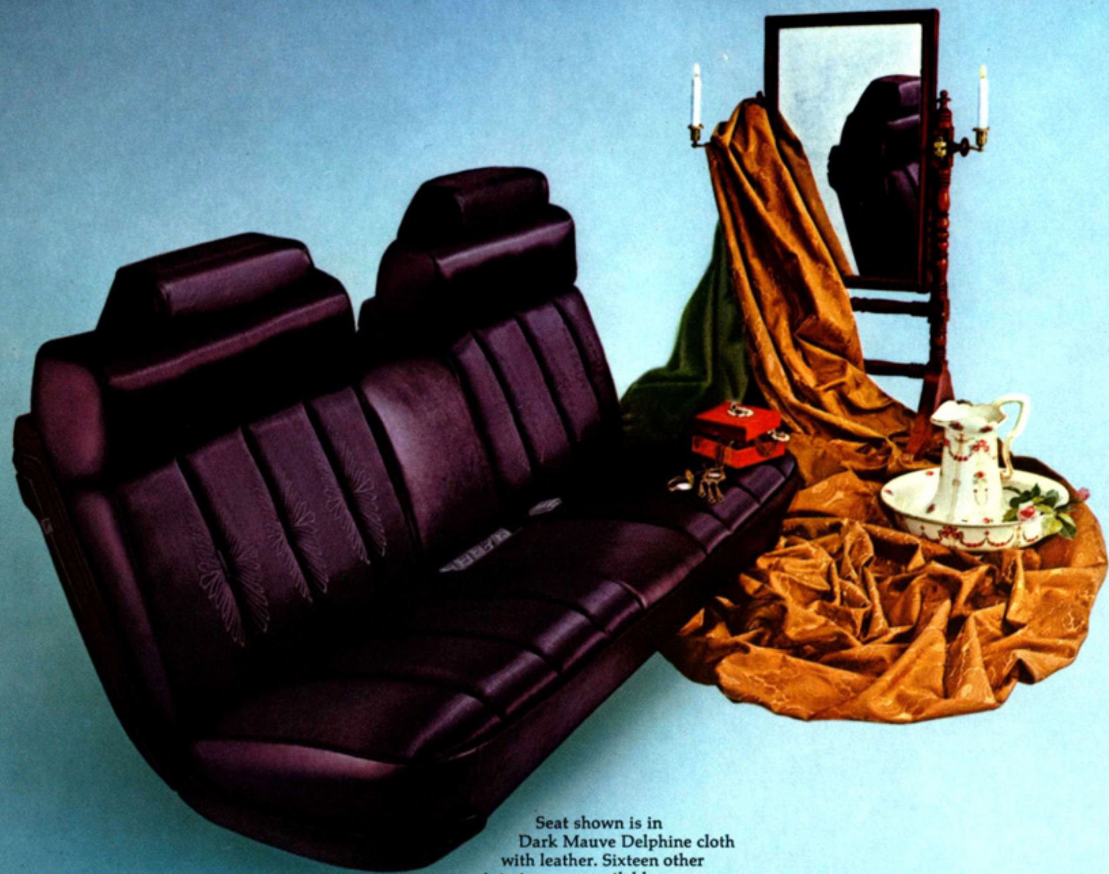
Seat shown is in Dark Mauve Delphine cloth with leather. Sixteen other interiors are available.