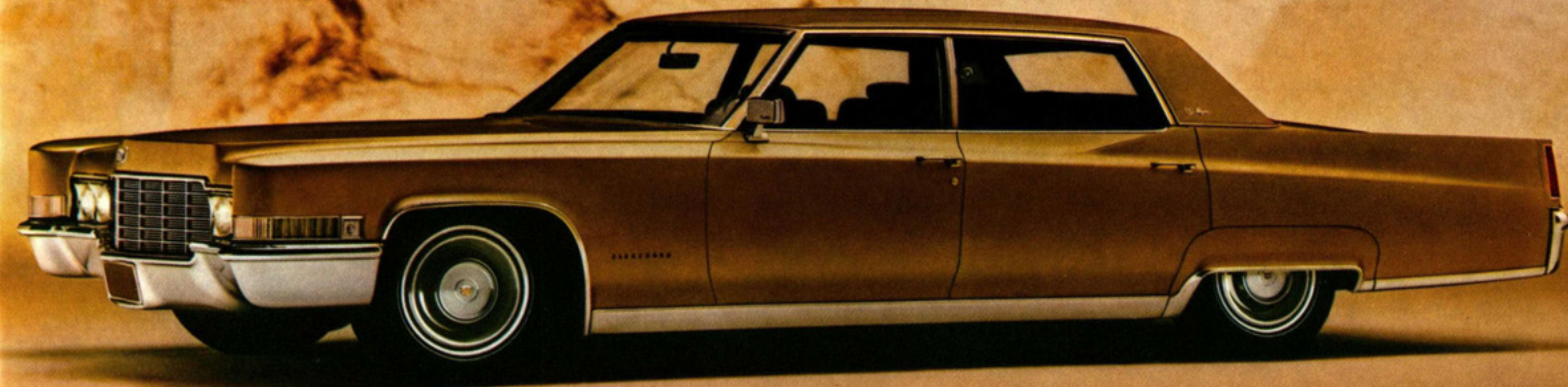
Fleetwood Brougham in Chateau Gold Element. Performance, Reliability, Comfort. A Young Man's Choice.

Some of the equipment illustrated is optional at extra cost.