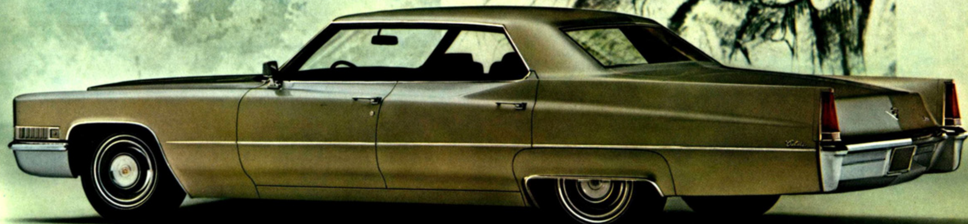
Calais Hardtop Sedan in Palmetto Green. Background: Rubens, A Young Man Walking. Fodor Collection, Municipal Museum, Amsterdam.

Some of the equipment illustrated is optional at extra cost.