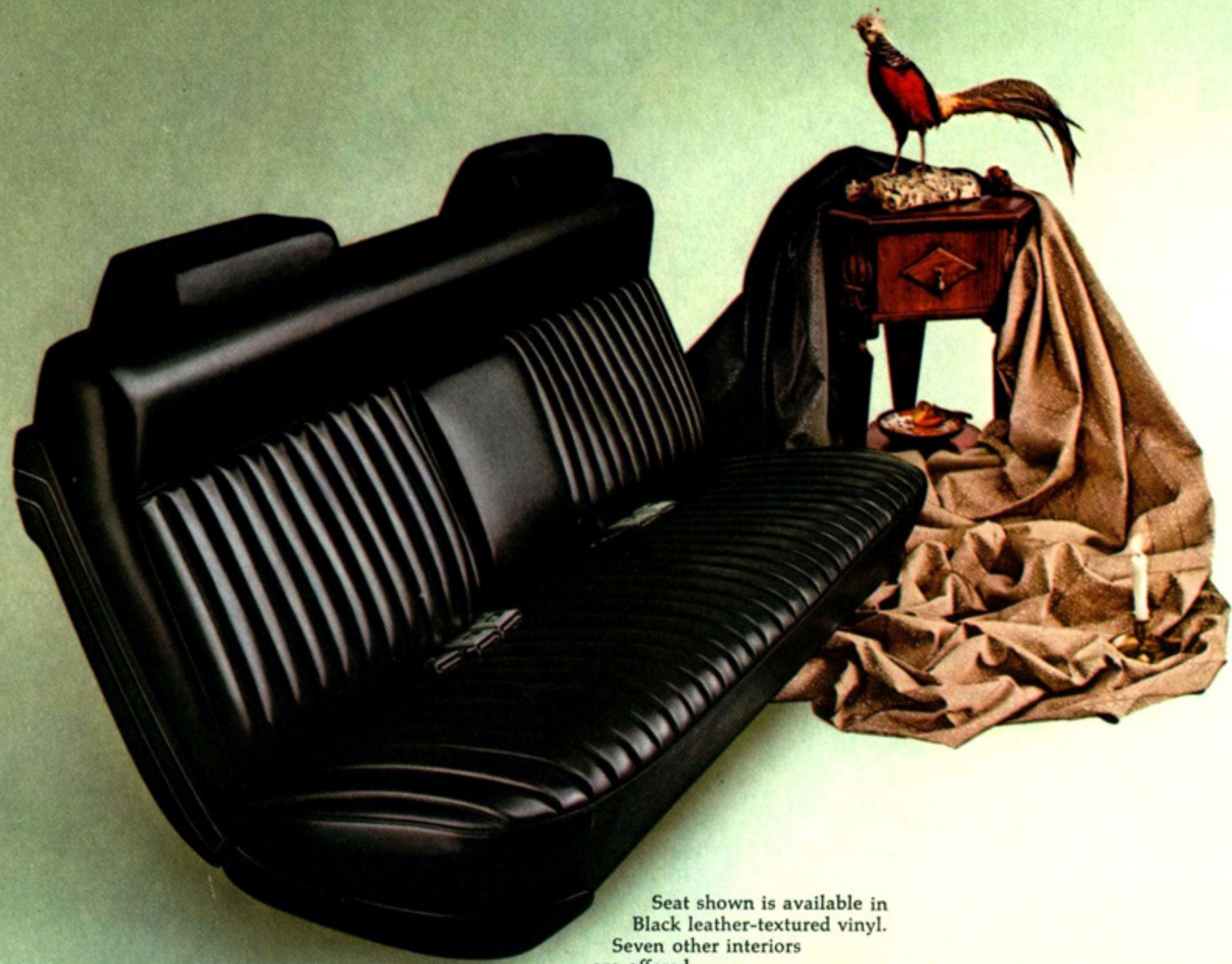
Seat shown is available in Black leather-textured vinyl. Seven other interiors are offered.