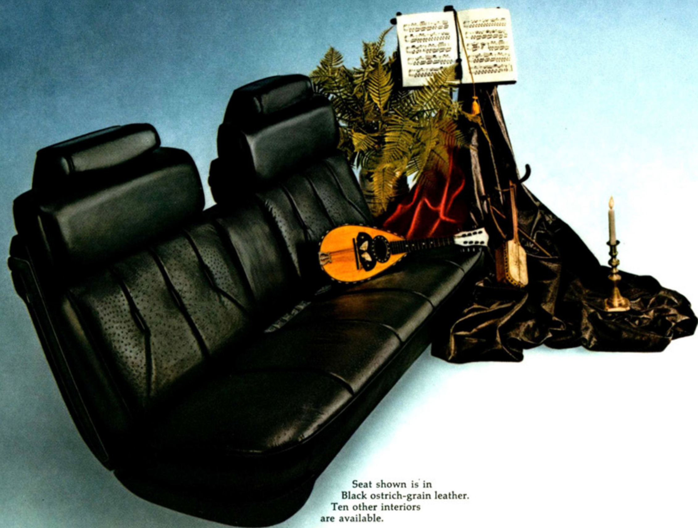
Seat shown is in Black ostrich-grain leather. Ten other interiors are available.