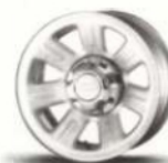
15" 7-Spoke Silver Styled Steel Wheel