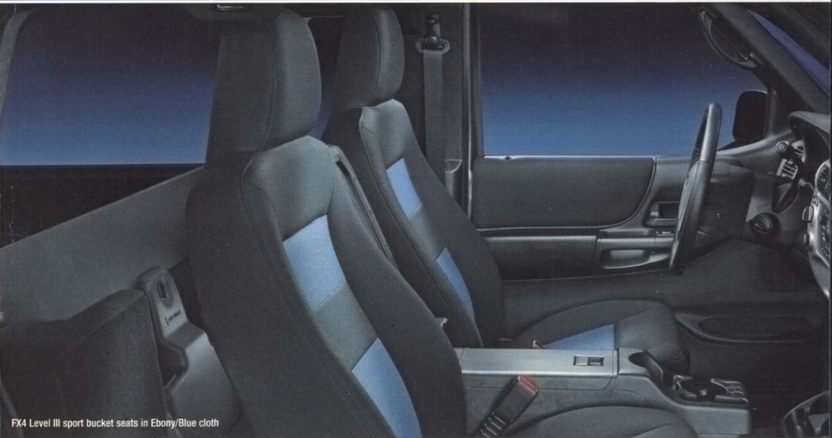
FX4 Level III sport bucket seats in Ebony/Blue cloth