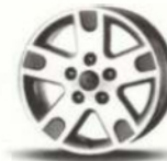
16" 5-Spoke Machined Aluminum Wheel