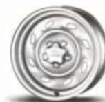
15" Argent Steel Wheel

Torsen is a registered trademark of Zexel Torsen Inc.