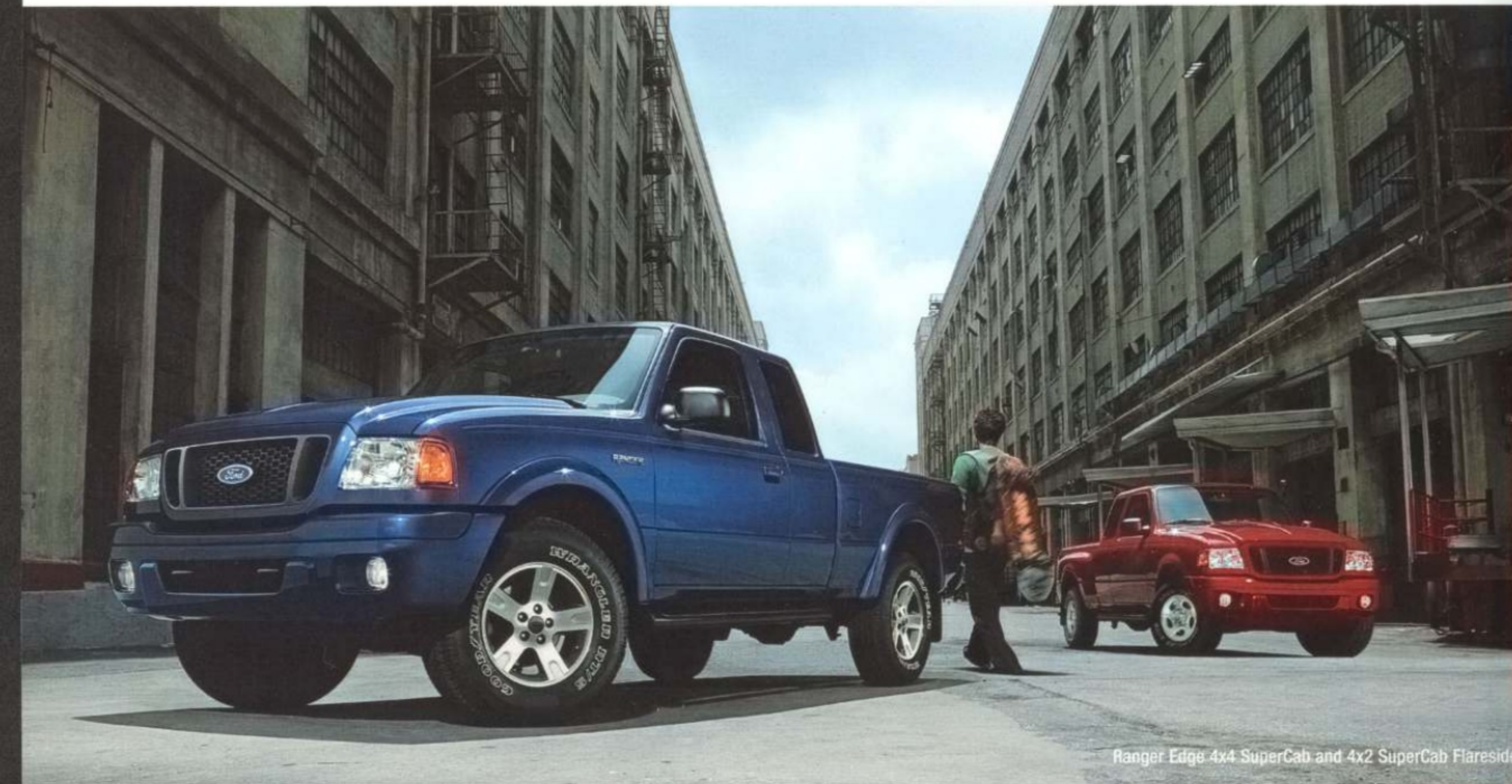
Ranger Edge 4x4 SuperCab and 4x2 SuperCab Flareside

You have been pre-approved by Ford Credit and your local Ford Dealer for $30,001.* Offer expires 1/16/04.