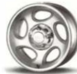
16" Cast Aluminum Wheel