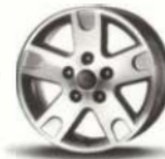
16" 5-Spoke Cast Aluminum Wheel