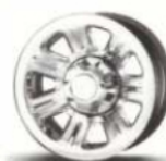
15" 7-Spoke Chrome Styled Steel Wheel