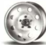
15" 8-Hole Forged Aluminum Wheel