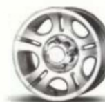
15" Machined Aluminum Wheel